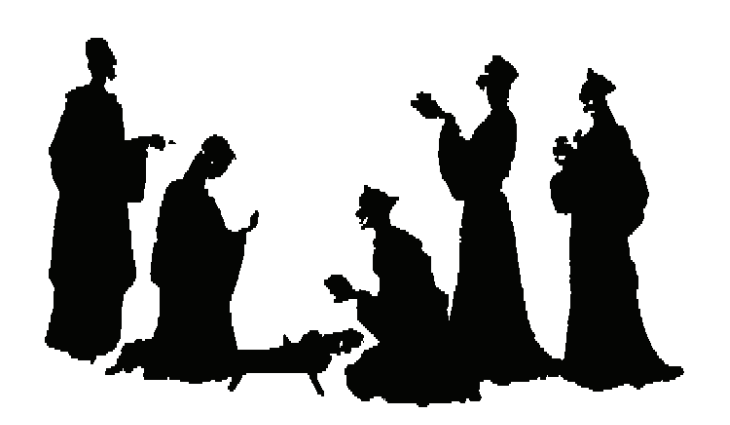
Come Let Us Adore Him Christ the Lord!

Thank you to St. Joseph CWL for a very generous donation of $1000 to the Parish to help fund the repairs to our organ. It has been in need of repair since at least 2019 and we are blessed to have it back in order and sounding beautiful.